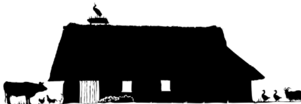
Artist: Lauren Munev

2:00 PM: UNESCO World Heritage Site Lorsch Abbey