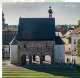
King's Hall, Lorsch Abbey

Lauresham Open Air Laboratory for Experimental Archeology is located a short walk away, with its Visitor Centre on its eastern side.